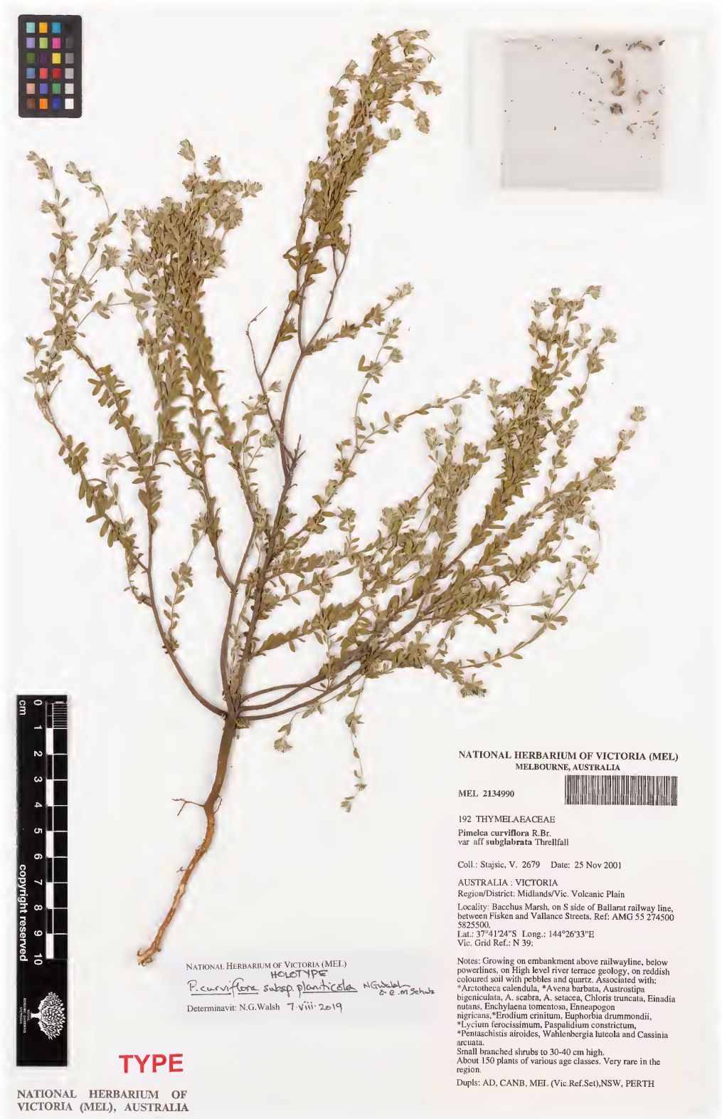
Figure 5. Holotype of Pimelea curviflora subsp. planiticola (MEL2134990).